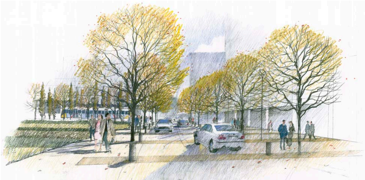
Figure 26: Zone III Roadway and Streetscape

Drainage within this area will be accommodated through a combination of valley drains and water quality catchment sumps.