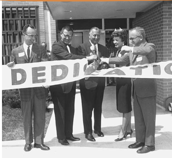
In 1962, Donaldson moved its general office to Bloomington and the company has since entered a number of industrial markets.